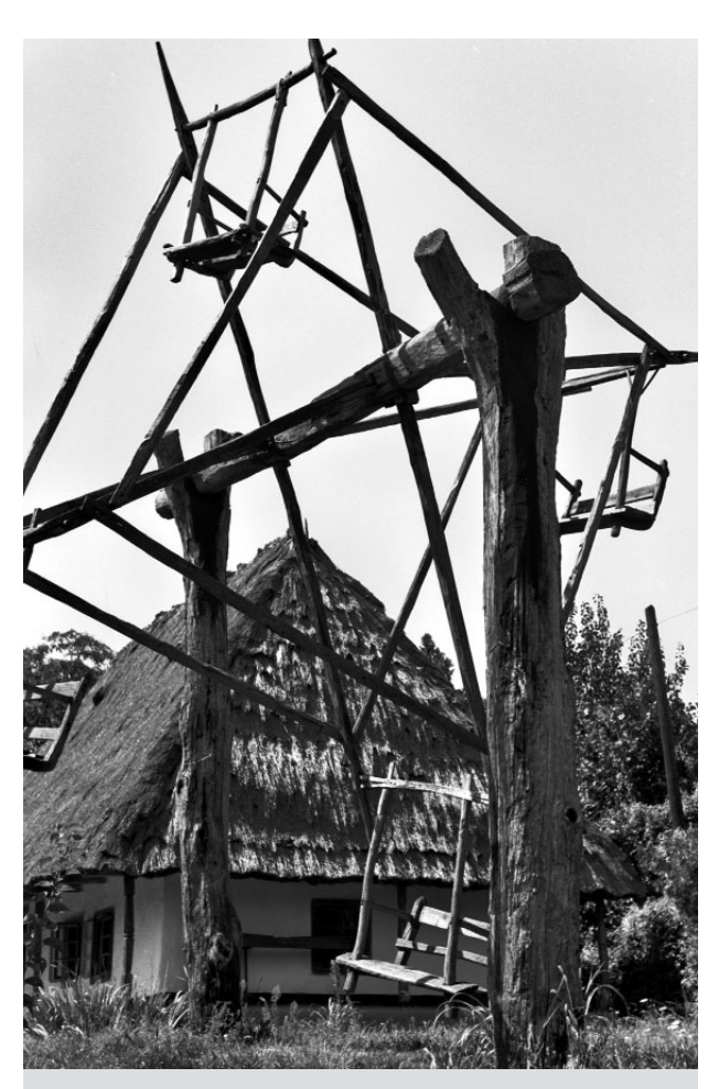
EASTERN BIG WHEEL IN THE COMMUNITY OF ZĂPODENI (ROMANIA) AT THE BEGINNING OF THE 20TH CENTURY.