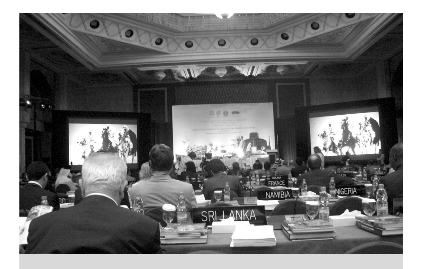
THE UNITED ARAB EMIRATES SHOWED THE COMMITTEE A PROMOTIONAL DOCUMENTARY ON THEIR INTANGIBLE CULTUAL HERITAGE.

facto cannot be locked up, preserved or protected. Ultimately, in the final text ideas related to presumed 'fossilization' of culture were left out and it focused more on making intangible heritage viable, guaranteeing that intangible practices can survive, or that knowledge of them is preserved and can be used for educational or practitional purposes. It is important that intangible cultural heritage was presented as 'dynamic heritage', constantly in a state of change. For that reason the system of canonizing lists of ICH, like the one with 'masterpieces', was debated, as it was hierarchical and could lead, contrary to the character of this kind of cultural heritage, to a freezing of dynamic heritage. Nevertheless the 114 participating countries decided to make a 'representative list' with examples of intangible cultural world heritage, in order to raise awareness of these heritage treasures. This list however is directly based on the list of 90 'masterpieces' from 2001. During the fourth session, for the first time decisions were taken on new 'elements' nominated by the member states. 'Elements' of ICH are, according to article 2.1 in the convention, 'the practices, represen-