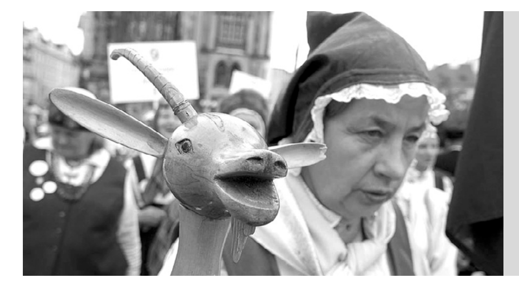
Atstaukas of Latvia, at the Prague Folklore Festival, 1 August 2007