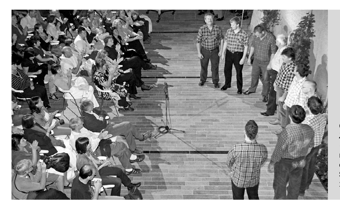
CONCERT OF ZAJUCKAJ IN ZAPOJ - SHOUT AND SING -FOR THE PARTICIPANTS OF THE CONFERENCE, SEPTEMBER 26, 2009.

brought together papers that analyzed the relations between folk literature and belles-lettres, and presented concrete genres in folk literature and literature proper, especially the ballad. In addition, a special panel was organized within this group to discuss animals in folklore. Short discussions took place immediately after the paper presentations.