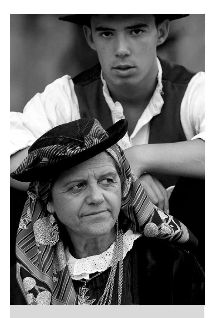
Grupo de Dancas e Cantares de Santiago de Bougado, 2007

Culture takes place. We need to reflect on what that simple fact means, in general and for our disciplines in particular. People rarely take a place as they find it, but do they actually make – in the constructivist sense – the places they live in, or are they rather co-creators shaping the places that they are shaped by? On the third day of the Congress, we want to put a spotlight on the ecological relationships with both human and non-human makers of places through which culture is lived, and on the responsibilities that we as researchers face when we are dealing with them, both 'in the field' and afterwards, in our ethnography and beyond. Intellectually, most of us are aware that we are part of 'the field' which is also part of us – but are we actually addressing that issue concretely in our work, and if so: how? What are our responsibil-